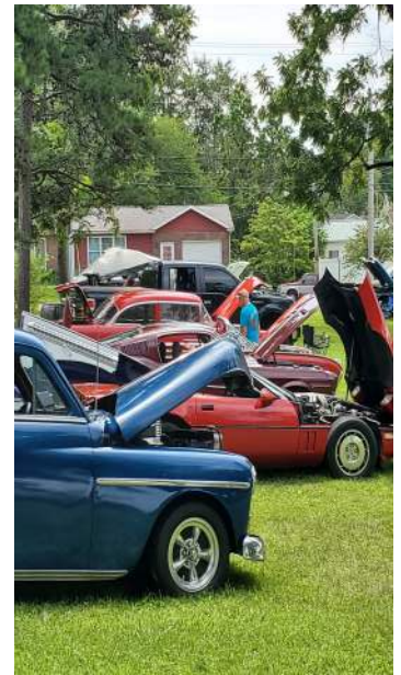
Scene from a past show.

The public is invited to view the cars, vote on special awards, enjoy concessions and visit the museum.