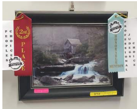
Glade Creek Falls