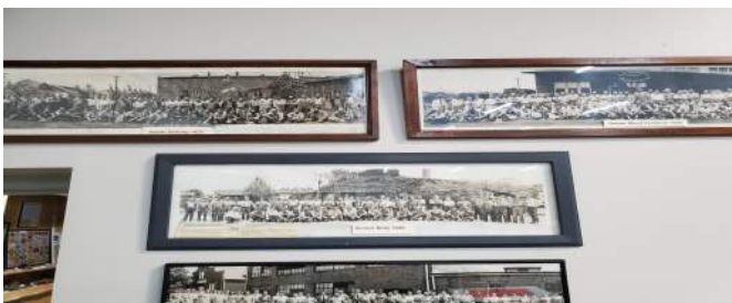
Examples of pictures (on left) on display in Wood Industry showing factory employees taken in the 1930's.