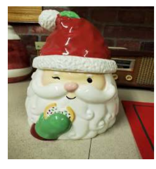
Dubois County Museum