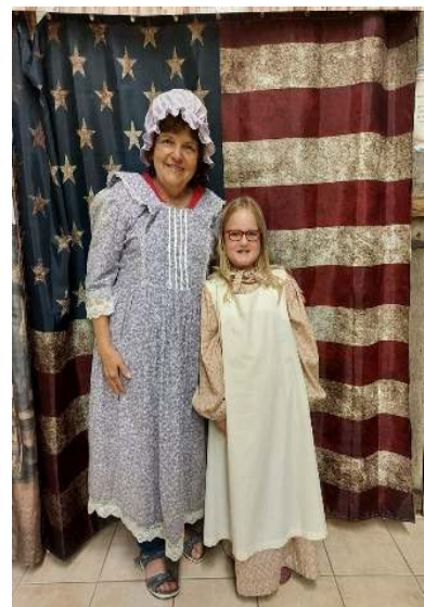
Special photo op of Grandmother and granddaughter in Children's Area.

We hope to see you in November for Storytime, the Veterans Day program, Coin Club, Model Train Club meeting, Play Day, 4-H Spark program, tours, Festival of Trees and a wellness walk through the museum. The Dubois County Museum is a great place to visit and entertain your family.