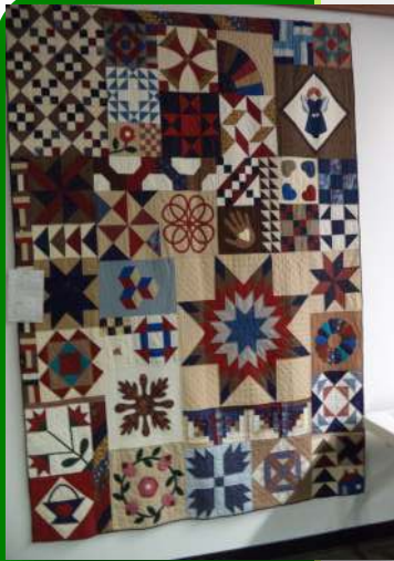
Quilters Guild artwork highlighting many quilting patterns.