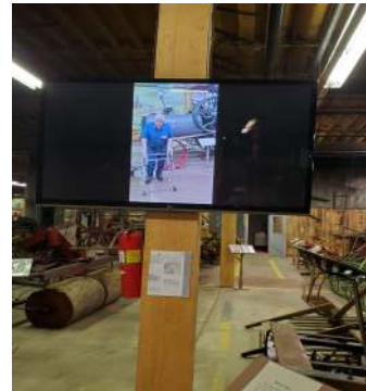
These videos are recording some terrific memories shared by many people.

Two. More recordings are planned of different areas in museum.