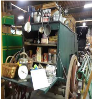
For those using the delivery